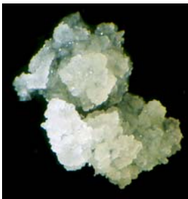
Maize type II callus