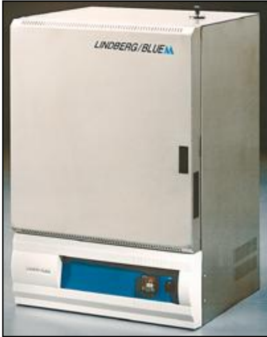
Model 1420SA Shown